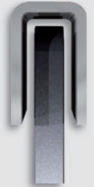
SIDE VIEW OF SENSOR/ACTIVATOR CONFIGURATION